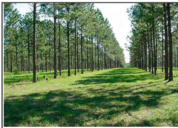
Silvopasture in a Southern Yellow Pine Plantation

Advantages of properly managed silvopasture systems include the potential for increased income as well as significant ecological benefits due to the simultaneous production of trees and forage. In