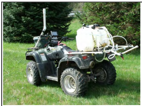
ATV sprayer with GPS swath guidance system