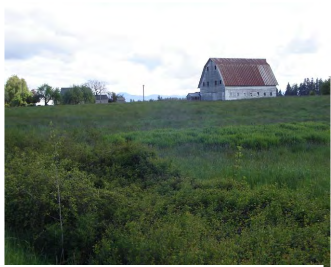
Abandoned farm, Clark County, Washington

In the last few years, HFI Consultants have been assisting such rural landowners in converting their farmlands to the Timberland classification to avoid the large bill that comes with losing their deferred tax status.