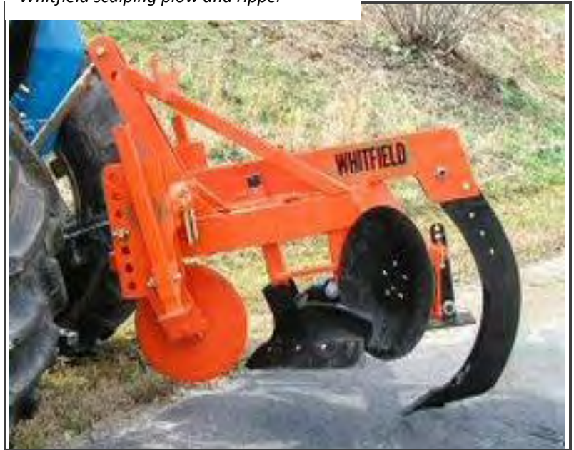
Whitfield scalping plow and ripper

Minimal disturbance of the soil is generally preferred to reduce the potential for the invasion of noxious weeks and/ or the introduction of undesirable plant species. Extensive plowing or full field tillage is only recommended when a new forage crop is to be planted. The application of a pre emergent herbicide may be required to reduce competition, conserve soil moisture and minimize animal damage. Animal damage control measures, such as bud caps, seedling tubes or stem wraps, may be required to protect the tree seedlings from deer and rabbit browse or stem girdling from meadow voles.