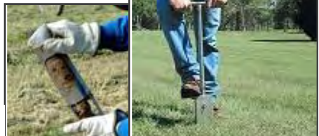
Careful soil assessment is a must

The next step is to perform a site assessment. Web based resources are utilized to identify site attributes including acreage, elevation, slope, soil types, adjacent land use, and the presence of streams, floodplains, hydric soils and wetlands. A soil analysis is performed, including core sampling, to identify soil characteristics and the presence of hardpan layers or areas of highly compacted soils. Soil analysis is vitally important, not only to properly select the tree and forage species best suited to the site but also to determine the required site preparation. The site assessment will also analyze the existing vegetation on site including the identification of undesirable plants and or noxious weeds. Wildlife habitat and critical areas and opportunities to enhance habit will be studied. A good plan will consider the impacts to and from adjacent landowners and the shade or visual element the plantation will effect in time.