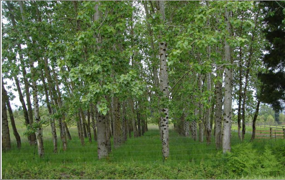
15 year old stand of cottonwood managed as silvopasture, Ridgefield,