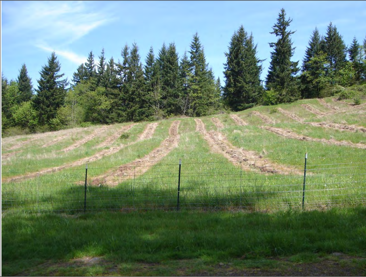
Initial site preparation and planting. Soil is cultivated and grasses are treated, prior to planting.