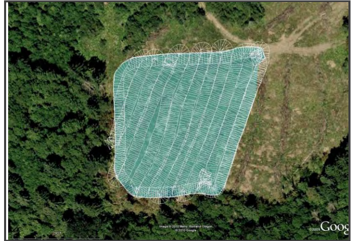
GPS Map detailing row spacing and alignment.

The next step is successful implementation of the silvopasture plan. Selected site preparation tools may include rotary brush hog field mowers or flail cutter to remove unwanted vegetation. Specifically designed sod scalping plows are often required to remove thick sod layers and create a suitable tree planting zone. A GPS guided tractor or ATV is utilized to establish uniform row spacings and alley configurations. GPS guidance also provides the means to create a detailed map of the project. A calibrated sprayer provides a metered dose of prescribed herbicides to just the tree planting rows. Additional herbicide application may be required in the forage alleys depending on the composition of the existing plant community and the goals and objectives of the plan.