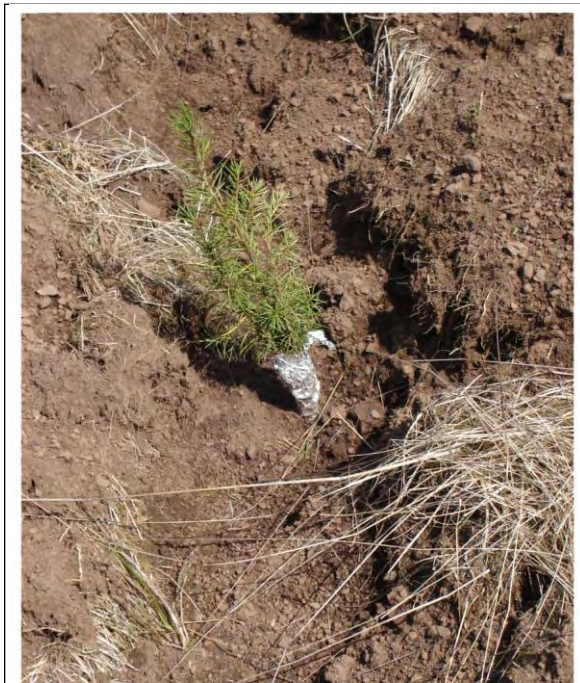
Foil wrapping to prevent girdling by meadow voles

Multiple silvopasture designs may be required on a single site due to the presence of hydric soils, critical habitat and the desired tree or forage species. Acquisition of high quality tree seedlings for the site and the timing of tree planting is also a crucial element of a successful system. The benefit of good plan and successful site preparation may be lost if a poor quality planting stock or forage seed is planted, or good quality stock is improperly planted. If animal damage is anticipated, protection measure should be applied soon after planting.