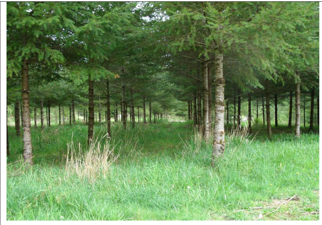
15 year old stand of Douglas-fir Silvopasture. Stand is thinned and trees are pruned to increase sunlight to the forest floor.