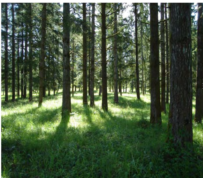
Well managed silvopasture in Clark County, Washington

Although this practice is relatively unheard of in the Pacific Northwest, it is very common in the Southeast United States and has been used for centuries in other parts of the world. Silvopasture designs and techniques are very site specific with consideration given to the site conditions including soil type, rainfall, tree species, and vegetation and livestock management. A USDA Agroforestry Center report says "silvopastures can provide economic returns while creating a sustainable system with many environmental benefits. Well managed silvopastures offer a diversified marketing opportunity that can stimulate rural economic development." The same report states that "Silvopastures can increase wildlife diversity and improve water quality. The forage protects the soil from water and wind erosion while adding organic matter to improve soils properties...."