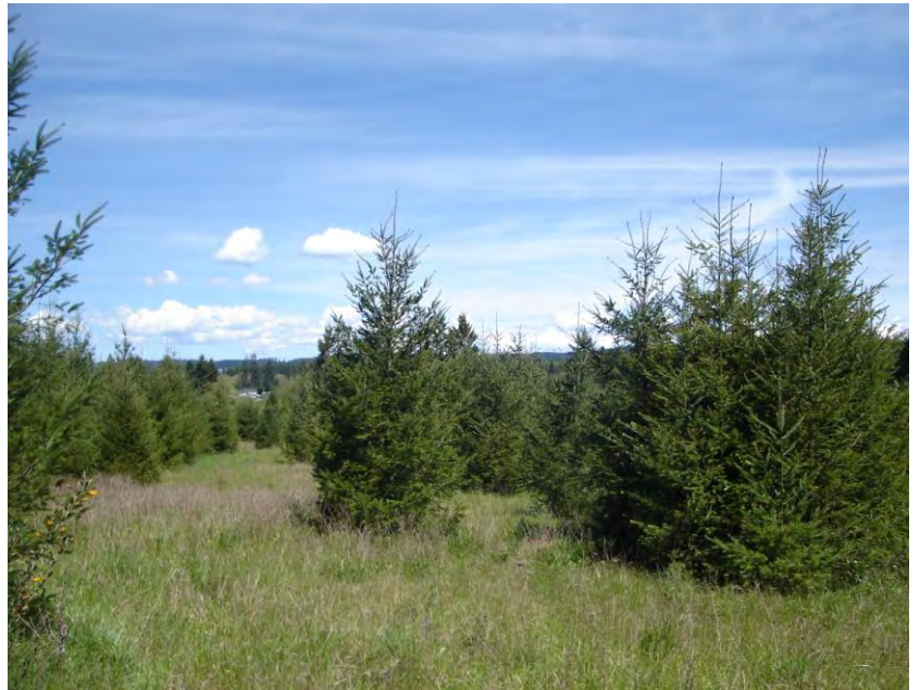
Converted pasture with clusters and rows. Approx 12 years of age

Silvopasture conversion costs can range from as little as $350 per acre, to as much as $1,500 per acre depending on the level of site preparation required and species planted. Maintenance costs can add $50 per acre per year or more for the first five years depending on the site conditions.